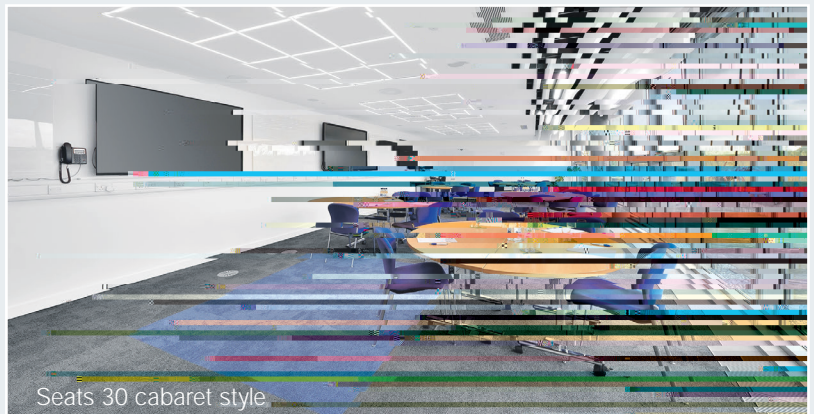
Seats 30 cabaret style